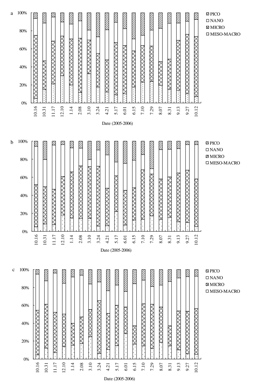
Figure 2. Annual variations of chlorophyll a percentages of size-fractionated phytoplankton in Apostichopus japonicus culture ponds (a: Number 3 pond, b: Number 4 pond, c: Number 9 pond).

pico) has greater competitive advantage in oligotrophic waters; Picophytoplankton usually predominates in sea areas with poor or intermittent nutrient supply; As eutrophication progresses and nutrients accumulate, microalgae with a short growth cycle dominate and the abundance of picoalgae declines (Stockner & Antia, 1986; Gobler, Cullison, Koch, Harder, & Krause, 2005; Totti et al. , 2005). Large phytoplankton (such as micros)