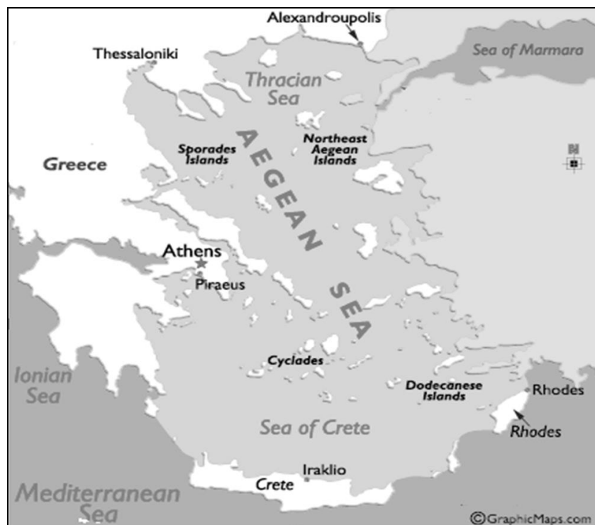
Figure 1. Sampling area.

The second pleopods were removed at the base to ensure the intact removal of the endopodite and the appendix masculina. The pleopods were stored in 70% alcohol and the total surface and the perimeter of the appendix masculina of mature males (Stage II) were estimated based on the images taken from that body part using the Image analysis Pro Plus software (Figure 2). The perimeter and surface measurements were given in mm and mm 2 , respectively. The relationships between the appendices' surfaces vs. CL and among the appendices in each species were studied using the linearized allometric model, \log y = \log a + b \log x , which has a slope of b , the allometric growth constant. If b > 1 , then the dimension y increases relatively more rapidly than does the reference dimension x , and the growth is considered as positively allometric. Otherwise, b < 1 indicates negative allometry, and b = 1 indicates a condition of isometry. The type of allometry was determined by testing the slope ( b ) of the obtained regression equations against the isometric slope of 1