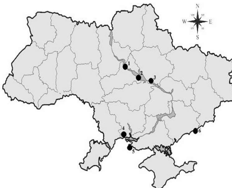
Figure 1. Schematic sampling locations of the black-striped pipefish in Ukraine.

Notes: 1 – Kremenchug reservoir, stream part; 2 – Kremenchug reservoir, lacustrine part; 3 – Dneprodzerzhinsk reservoir; 4 – Berezansky estuary; 5 – Tendrovsky Bay; 6 – Berdyansk Spit. Note: The sampling points 4–6 – by (Movchan, 1988).