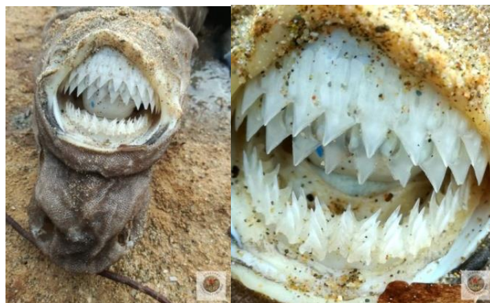
Figure 2. Head images of the stranded female kitefin shark showing its characteristic teeth rows