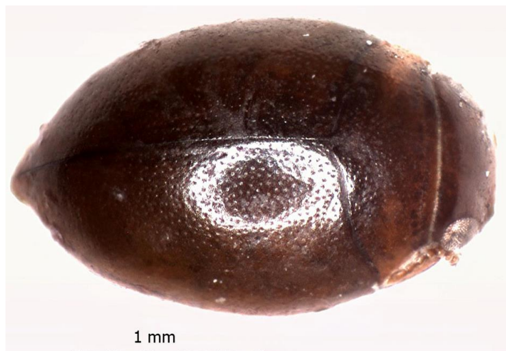
Figure 3. Hydrovatus acuminatus .

Remark: First record for Turkey. East Palaearctic species (Nilsson & Hájek, 2016). Nilsson & Hájek, (2016) listed Hydrovatus acuminatus as having distributions in Turkey. We have not been able to verify the literature