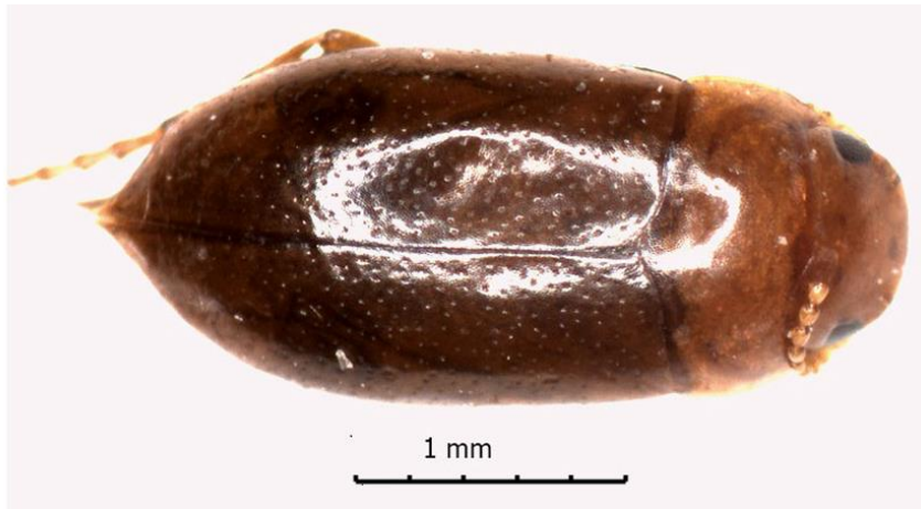
Figure 2. Hydroporus scalesianus .