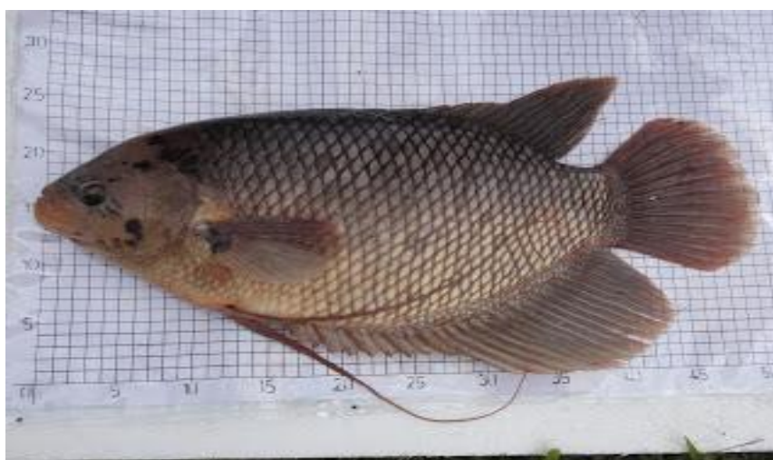
Figure 1. Gurami Fish ( Osphronemus gouramy ).