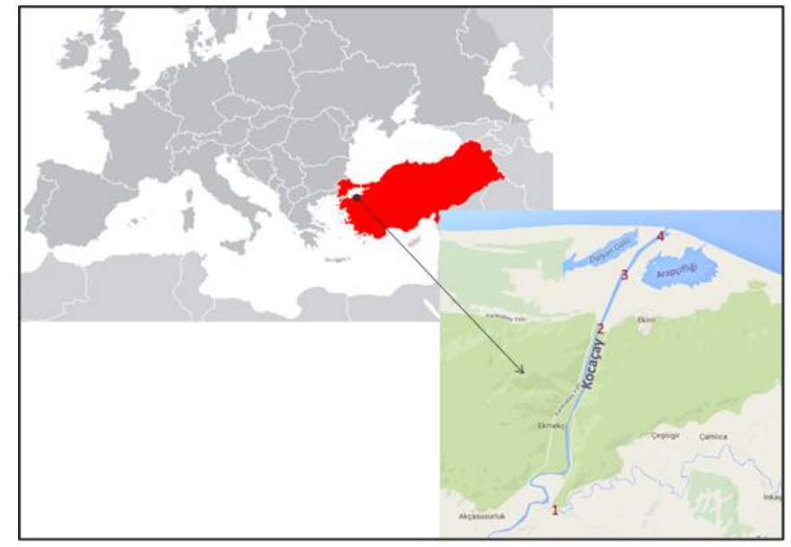
Figure 1. Sampling Area (Akbulut & Tavşanoğlu 2015).

То investigate the zooplankton species composition, samples were collected by vertical haul using a standard plankton net of 44 \mu m mesh size from 4 different stations (Figure 1; Table 1). Zooplankton samples were fixed in Lugol's solution (4%). The zooplankton species were identified as possible as species level under the binocular microscope (Leica DM5000B). Among zooplankton, Cladocera and Copepoda were identified according to Scourfield & Harding (1966), Kiefer (1978), Reddy Ranga (1994), Smirnov (1996), Flößner (2000), and Dussart & Defaye (2001). Rotifers were identified according to Emir, (1994), Koste, (1978), Ruttner-Kolisko, (1974), Segers, (1995), Nogrady & Paurriot, (1995), De Smet, (1996), De Smet & Pourriot, (1997), De Smet (1998). Zooplankton taxa were divided into different functional groups into feeding guilds (Barnett, Finlay, & Beisner, 2007, Obertegger & Manca, 2011; Bertani, Ferrari, & Rosetti, 2012; Lokko & Virro, 2014. The Guild Ratio was calculated as GR=(biomass raptorial-biomass