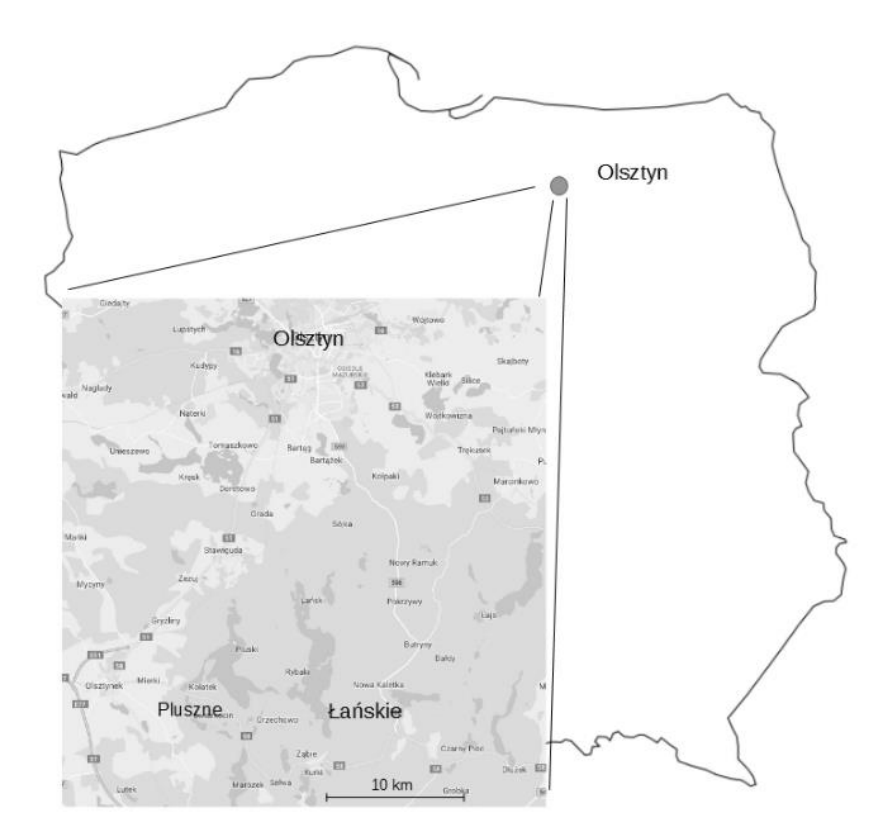
Figure 1. Study area was located in north-eastern Poland, near the city Olsztyn (Lake Łańskie and Pluszne geographical coordinates: 53°58′60″N, 20°48′08″E, 53°58′30″N, 20°42′06″E).

The roach (Rutilus rutilus L.), bream (Abramis brama L.), whitefish (Coregonus lavaretus L.), tench (Tinca tinca L.), perch (Perca fluviatilis L.), pike (Esox lucius L.) and rainbow trout (Oncorhynchus mykiss Walb.) were caught from two lakes of Mazurian Lake District and the ponds of Fish Farm Szwaderki (Poland) (Figure 1). These lakes are located next to each other and from the lake Pluszne in the south-east part flows the Poplusz River, which connects them with Łyna River and Lake Łańskie. Fishes from both lakes might migrate and population might mix. Results of the studies of polluting substances, including cadmium, showed that none of the chemical indicator does not exceed exposure limits and the study showed chemical good status of the water body. Therefore, the pollution of examined lakes by elements was similar. The fish were taken to the laboratory on the same day, where the body weight (± 0.01 g) and total length (± 0.1 cm) of each fish were measured (Table 1). Muscle tissue was extracted from the dorsal part. Liver and muscles were