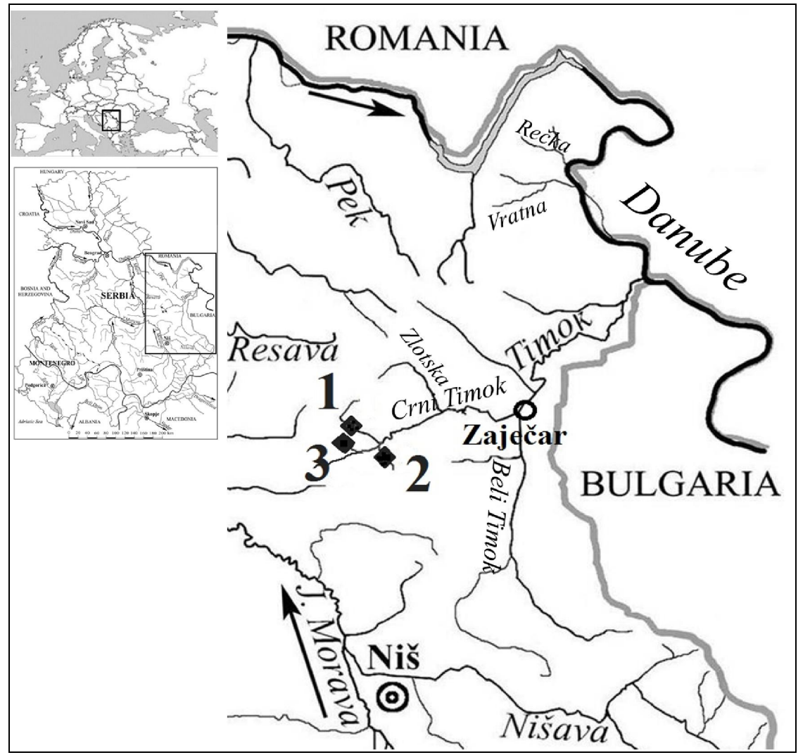
Figure 1. Sampling sites in the Crni Timok river system: 1) Radovanska stream 2) Mirovštica stream and 3) Lukovo spring.

AY185574, AY185575, AY185573.1, AY185576.1). In addition, the CR sequence of the MAcs1 haplotype (Accession Number AY836365) was used as an alignment aid, due to a deletion occurring at the position 113, as well as an outgroup OTU in rooting of the 50% Majority Rule consensus tree that was constructed using PAUP 4.0b10 (Swofford, 2001). Relationship with other haplotypes (applying NJ method and Kimura 2-parameter model) was assessed using MEGA 3.1 (Kumar et al. , 2004).