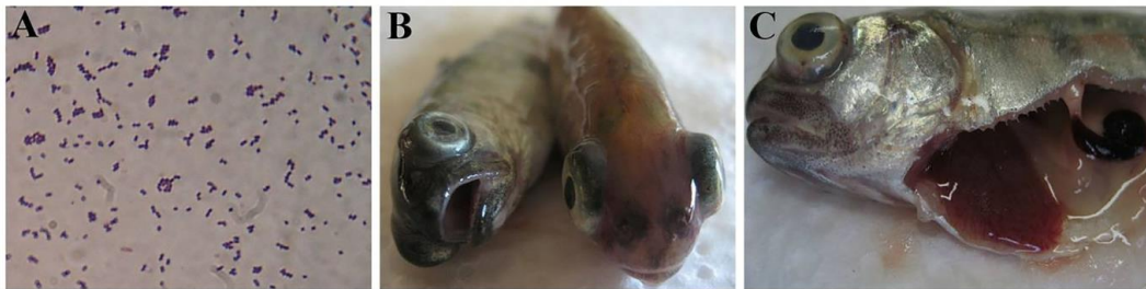
Figure 2. Gram staining of L. garvieae (A), bilateral exophthalmia (B), and haemorrhagic lesions on the liver and spleen (C).