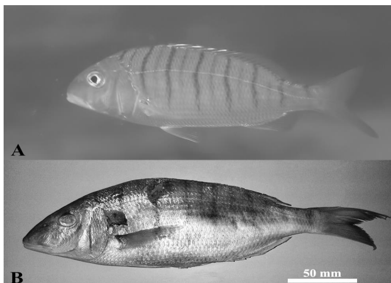
Figure 2. (A) Underwater photograph of L. mormyrus in south eastern coast of the Black Sea and (B) sampled specimen.

scaled. In front of each jaw, outer series of conical teeth slightly enlarged, followed by inner bands of shorter teeth. Dorsal fin spines: XI; dorsal fin soft rays: 12; anal fin spines: III; anal fin soft rays: 10, pectoral short, ending well before anus. Lateral line scales: 59. Coloration of live specimen: silvery grey, darker dorsally; 15 narrow transverse stripes, dorsal and caudal fins generally brownish, other fins lighter.