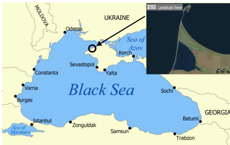
Figure 1. The hypersaline Lake Bakalskoye in the Crimea (Ukraine).