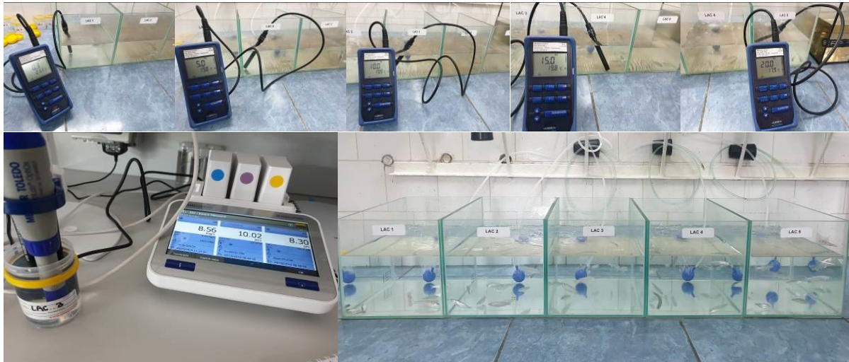
Figure 1. Salinity tolerance experimental set-up: individual tanks salinity measurements (up); pH and DO (%) measurements (down left); overview of test aquaria (down right) ( original photos ).

was taken on a Kern EW top loading balance.