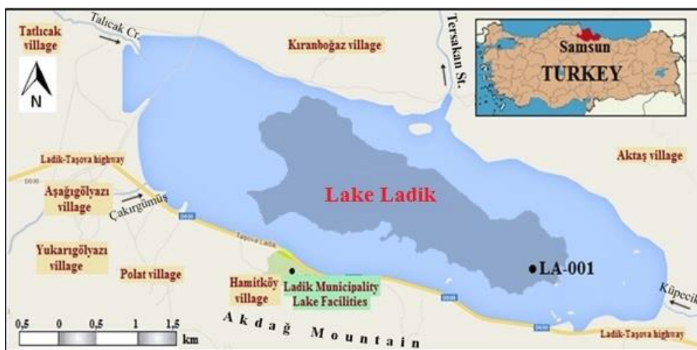
Figure 1. Location of the sediment core labeled as “LA-001” core reference in Lake Ladik. The gray-shaded area is the approximate natural extend of the lake before it became a water reservoir in 1958.

Sediments were sampled in both Lakes Ladik and Hazar using a UWITEC gravity corer in July