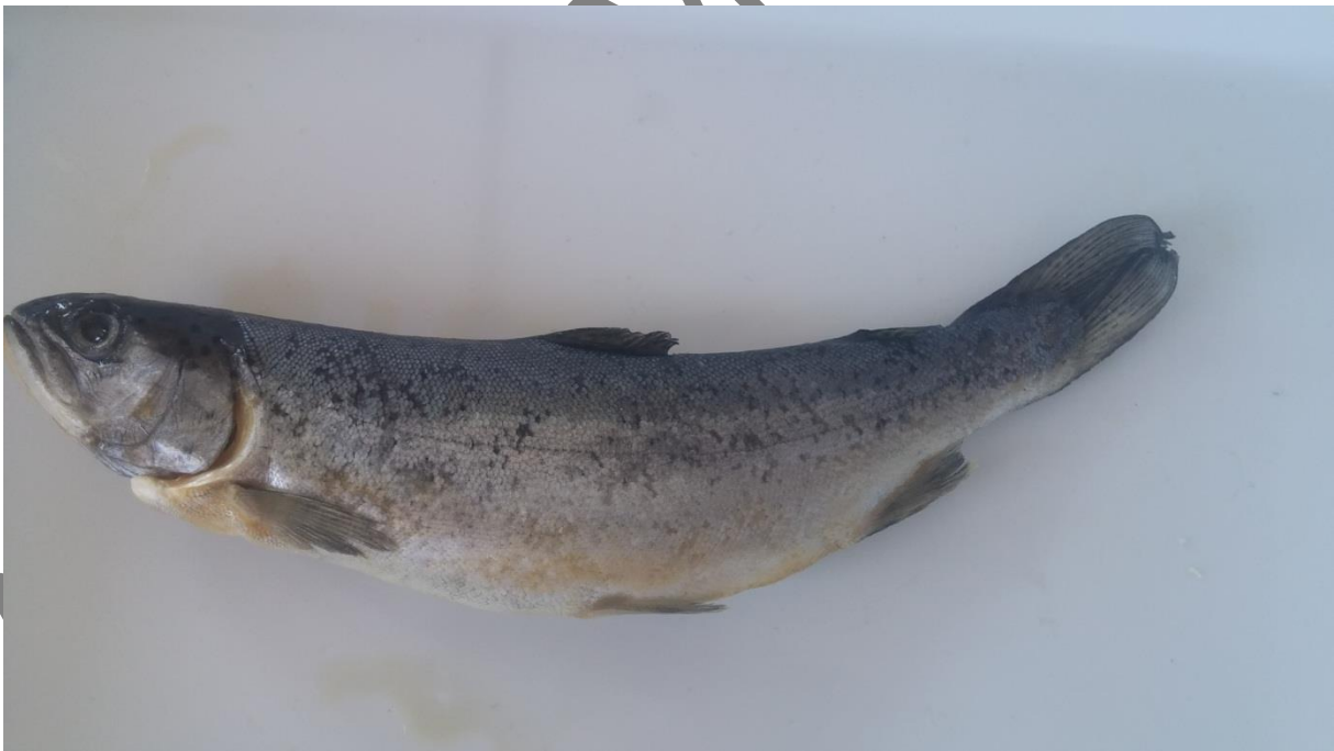
Figure 2. Oncorhynchus mykiss (cultured rainbow trout)