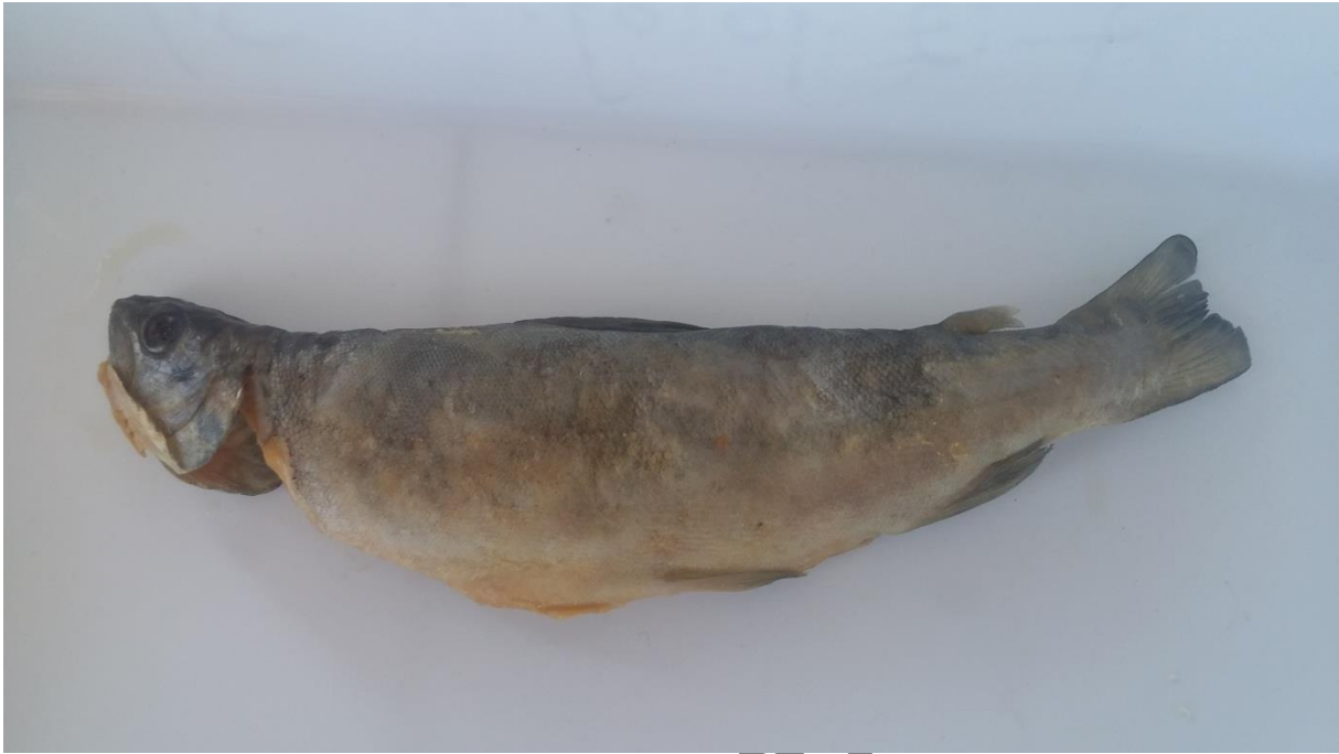
Figure 1. Salmo trutta macrostigma (wild brown trout).

*** a, b values for sample with different letters in the same fraction are significantly dif