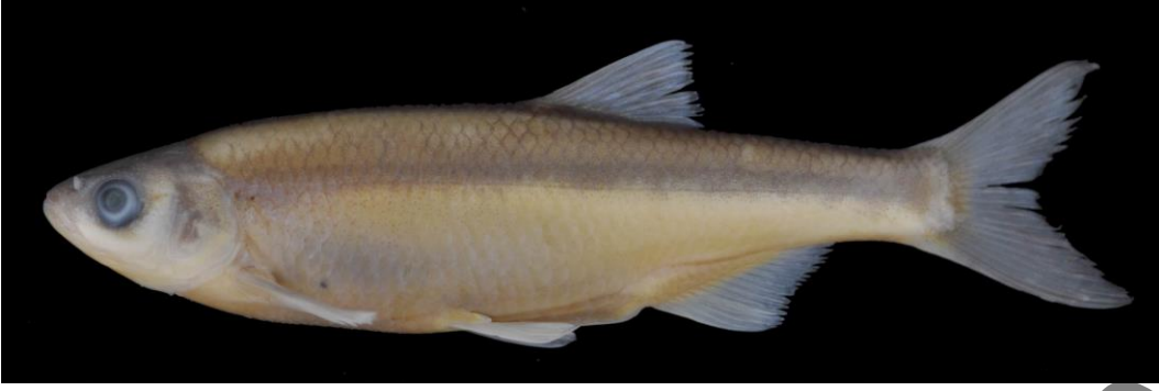
Figure 4. Alburnus escherichii about 130 mm SL, Yörükçirka, Porsuk Stream (IFC-ESUF 03-0335)