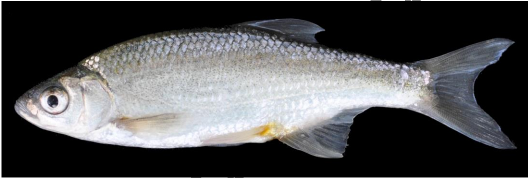
Figure 2. A. nasreddini about 109 mm SL, Selevir Reservoir (alive colour) (IFC-ESUF 03-0373)