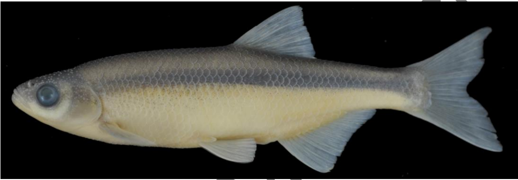
Figure 5. Alburnus escherichii about 178 mm SL, Üstünler Stream (Beyşehir Lake basin) (IFC-ESUF 03-0372)