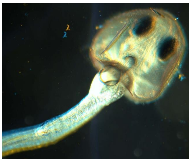
Figure 2. Remained egg shell cover on the head of newly hatched larvae in tannic acid treatment.

Tannic acid and enzymes act through chemical reactions between the substances and egg envelope structure, but milk acts mostly by physical binding of milk fat to the sticky surface of egg shell, neutralising