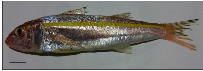
Figure 2. Specimen of Upeneus moluccensis , caught from Çandarlı Bay (Scale: 10 mm).