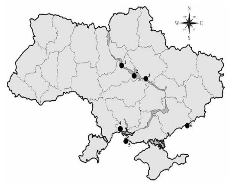
Figure 1. Schematic sampling locations of the black-striped pipefish in Ukraine. Notes: 1 – Kremenchug reservoir, stream part; 2 – Kremenchug reservoir, lacustrine part; 3 – Dneprodzerzhinsk reservoir;4 – Berezansky estuary; 5 – Tendrovsky Bay; 6 – Berdyansk Spit. Note: The sampling points 4–6 – by (Movchan. 1988).

data were recorded in the field to the nearest 0.1 cm and 0.01 g from the specimens collected. After that, specimens were kept in 70 % ethanol prior to examination of morphometric signs in laboratory.