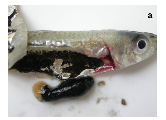
Figure 1. Gonads of the A.boyeri (a: ovary, b: testis)

According to 18 month GSI calculations, during both 2006 and 2007, egg development started in March (2.74 and 1.67), peaked in late June (9.16 and 13.44) and decreased in July (4.61 and 1.41) (Figure 2). According to field observations, A. boyeri spawn in shallow parts of the lake and the larvae develop in coastal and bay areas of the lake. In age classes 0 to